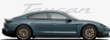
Taycan Turbo GT